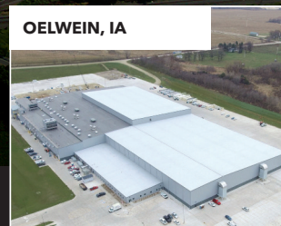
FILL, FORM, FINISH, AND DISTRIBUTION FACILITY

Operating the largest, single-site battery manufacturing facility in the world with on-site battery recycling in Lyon Station, PA, and distribution facilities across the country.